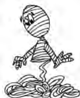
GREAT JOB WRAPPING LADIES...